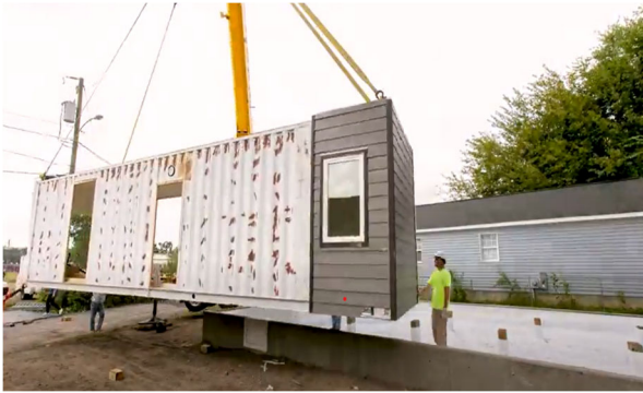
1 st of 3 Components being Placed on Foundation.