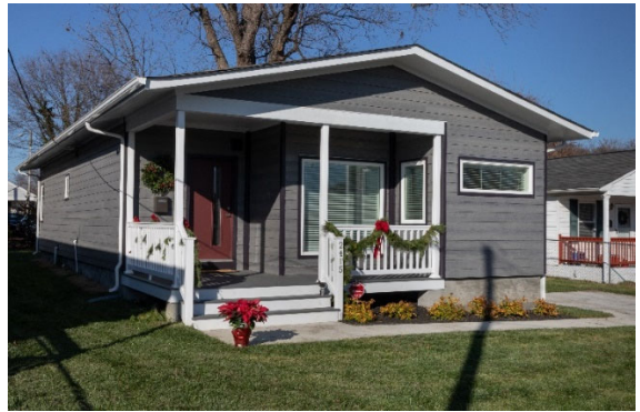
Finished indieDwell Home on Foundation