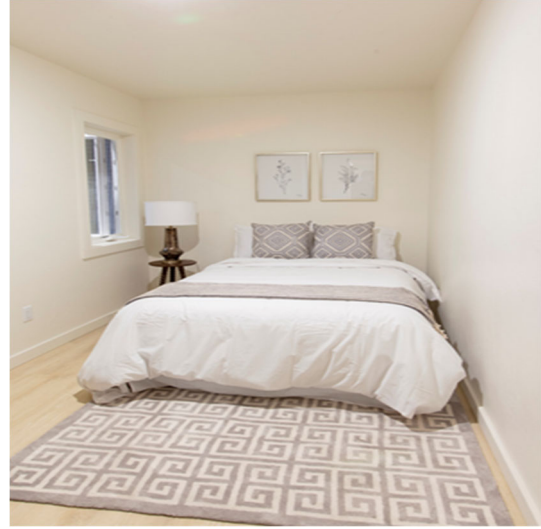
Interior of indieDwell Home