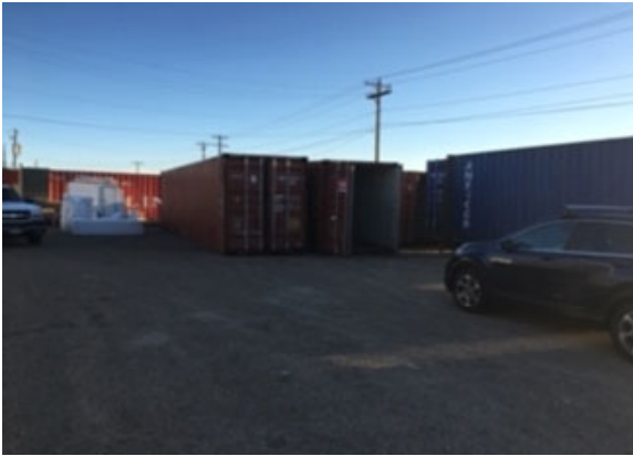
Idaho Factory Material Storage