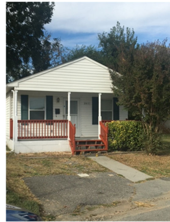
indieDwell Home Blends in well with Blackwell Neighborhood in Richmond Homes to the Left and Right of indieDwell Home