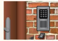
Remote Entry Devices

"There are many programs that provide services for homeowners. However, it is extremely difficult to meet the needs of the renters."