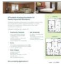
Heritage at Whiting