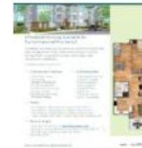
Willows at Little Egg Harbor