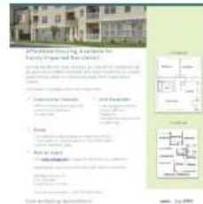
Visions at Absecon