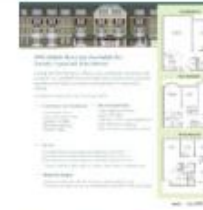
Hudson Ridge Residences