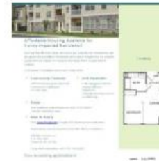
Visions at Absecon Senior