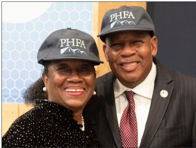
More photos giving a sense of the festivities during the two-hour event.