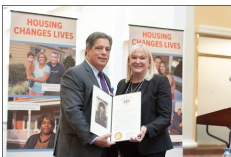
Special citations presented by the state House and Senate to PHFA.