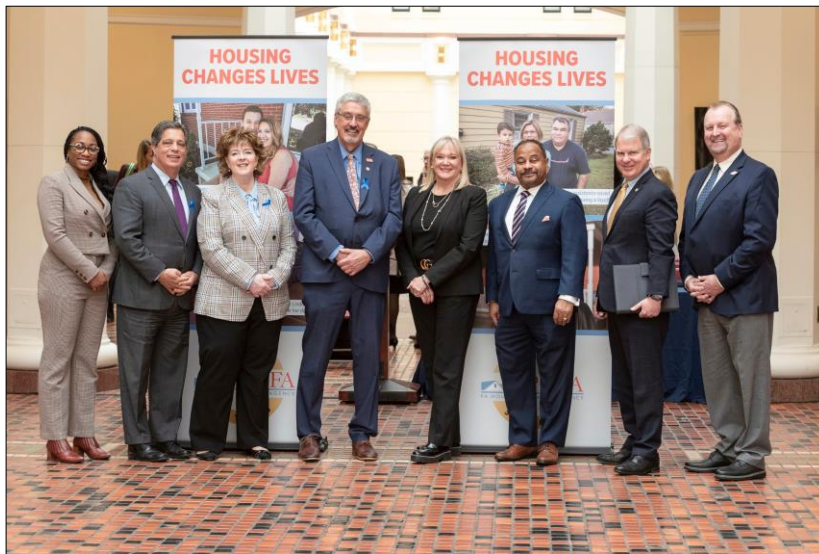
The main speakers from the event.