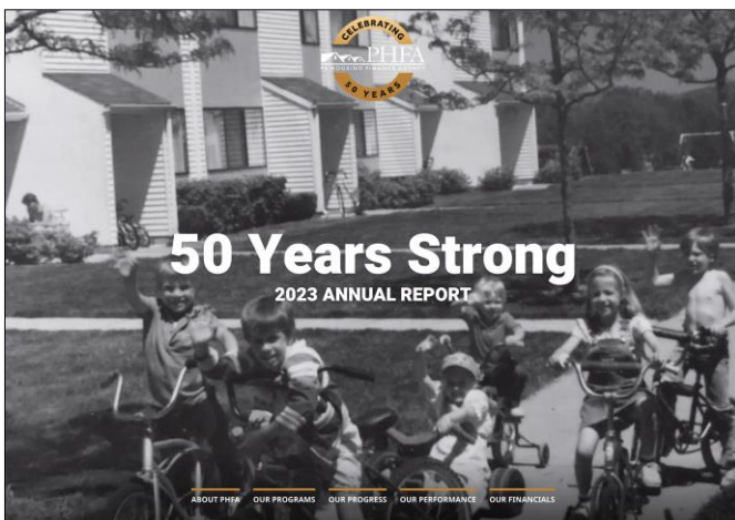
Clockwise from top-left: The time capsule starts to fill with memorabilia during one of our anniversary events; our special email signature used throughout 2023; a sample of one of the six pull-up banners used at numerous public events throughout the year; and the title page from our 2023 50 th anniversary edition of our annual report showing one image from an animated photo montage.