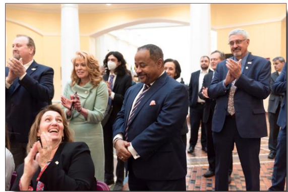
Images from our 50 th anniversary event recognizing our business partners