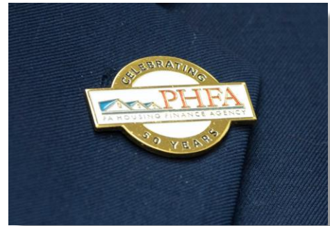
Our commemorative lapel pin.