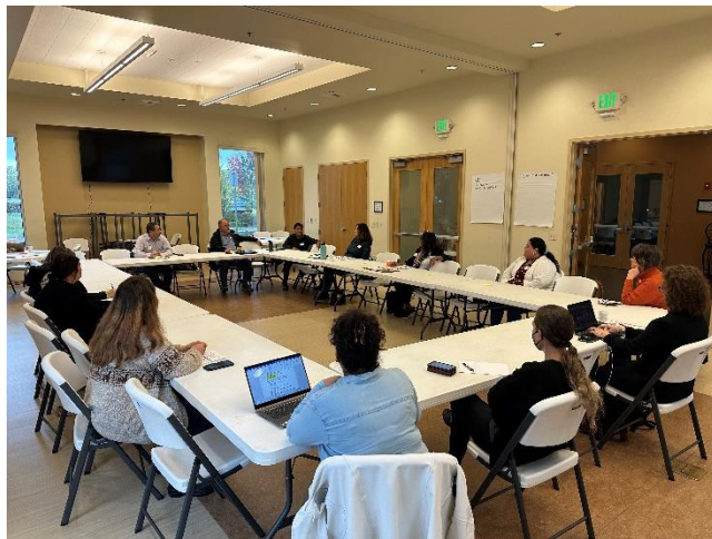
Figure 3: Photos from MWESB Peer Learning workshop in Southern Oregon