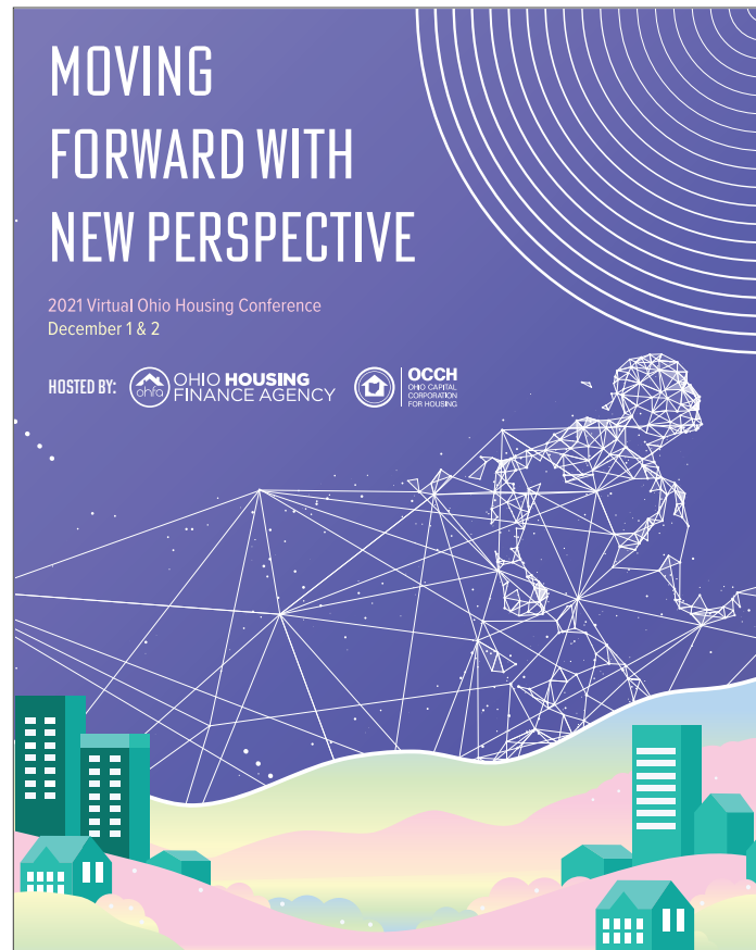
Figure 2. Marketing Campaign Materials

Save-the-Date Sponsorship Opportunities Teaser Video/Registration Open Reception Registration Conference Gift Session Spotlight SNAP and WIN Photo Challenge! Scholarship Opportunities