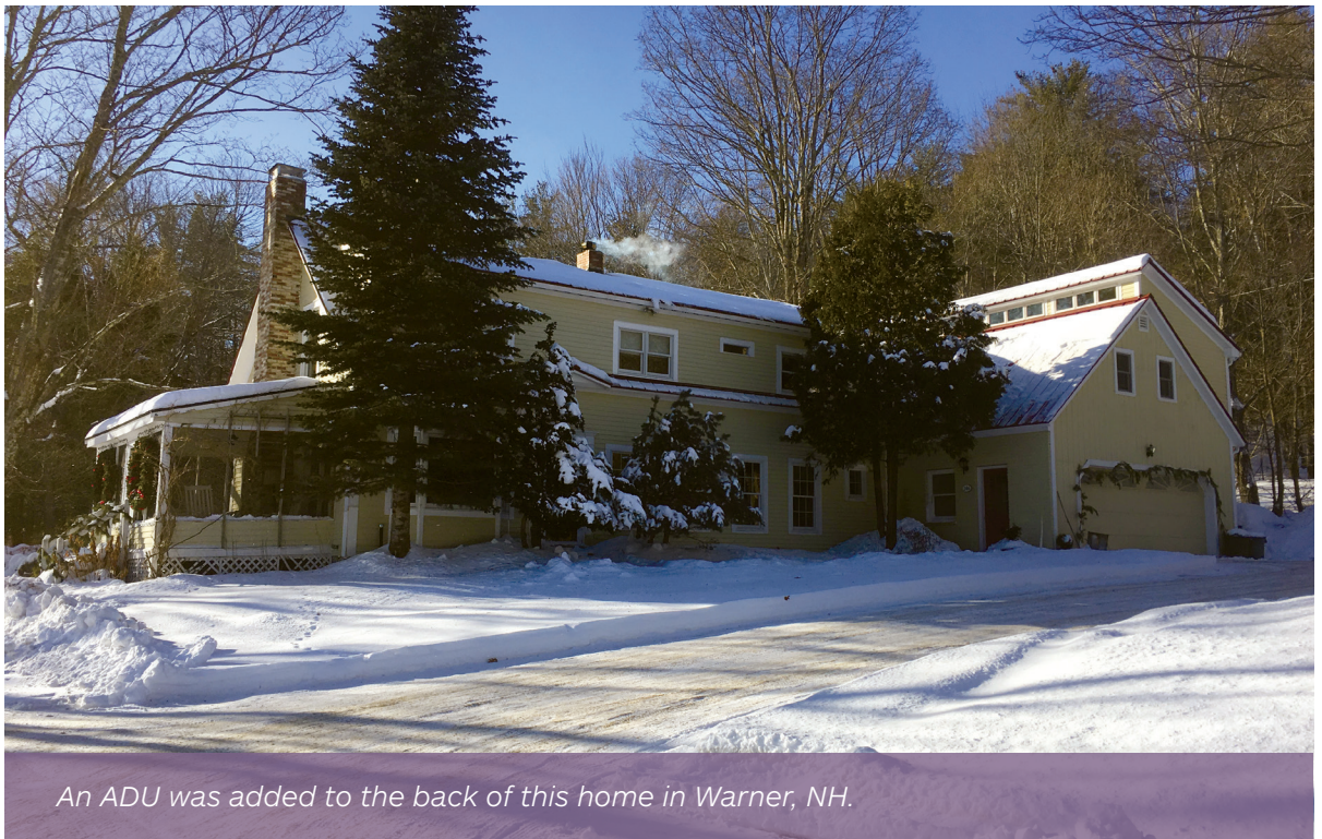
An ADU was added to the back of this home in Warner, NH.