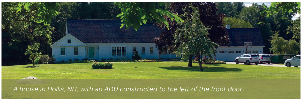
A house in Hollis, NH, with an ADU constructed to the left of the front door.