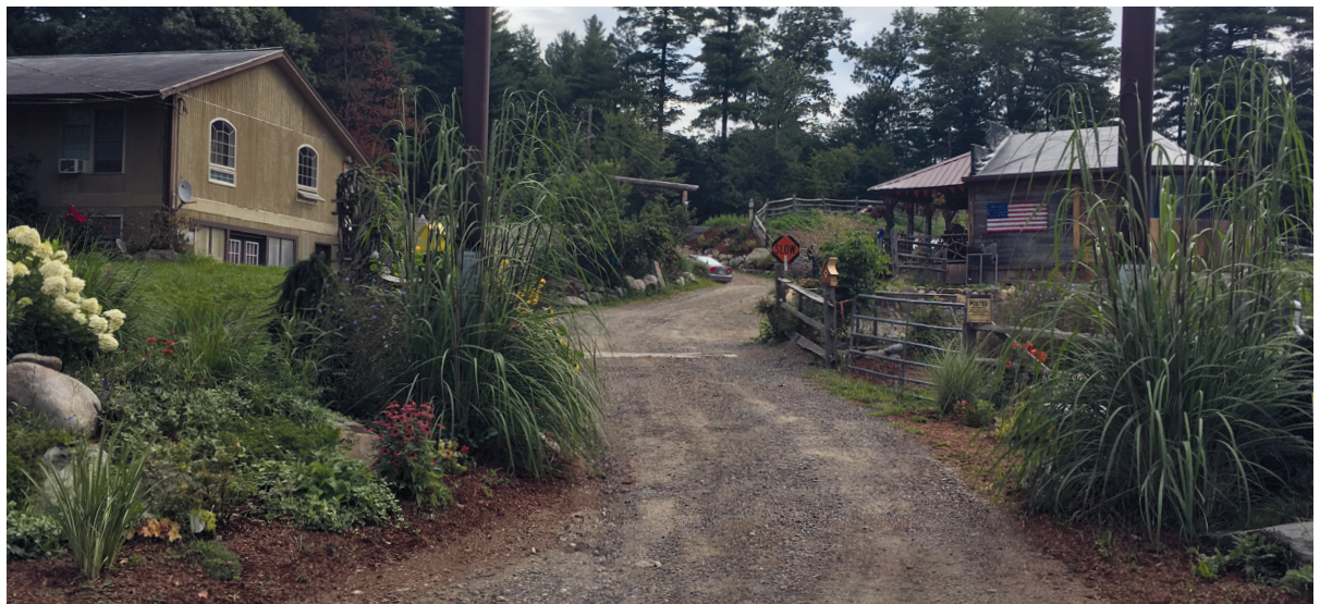
This property in Hollis has an ADU separate from the main house.