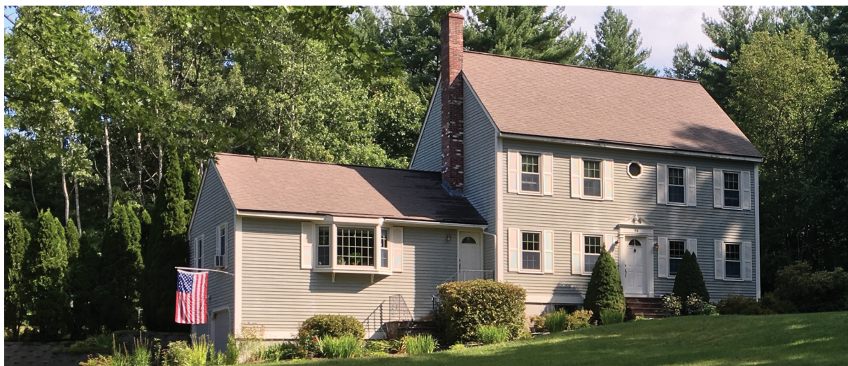
An ADU is seen attached to the left side of this home in Hollis, NH.