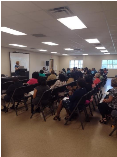
3 Photo From Louisiana Homeownership TT - Shreveport