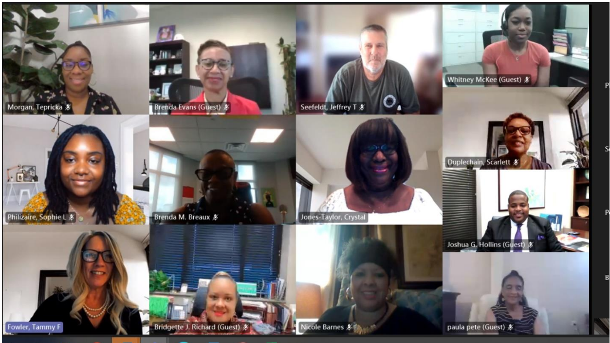
1 Louisiana Homeownership TT Planning Meeting