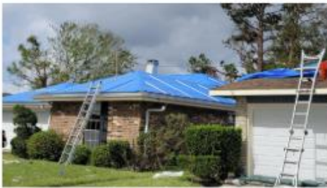
Blue Roof Installations.