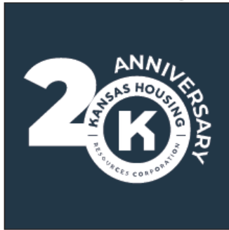
Variation White on Indigo