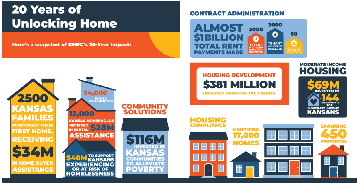
Comprehensive 20-year metrics