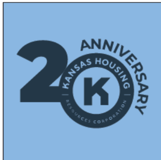
Variation Indigo on Blue