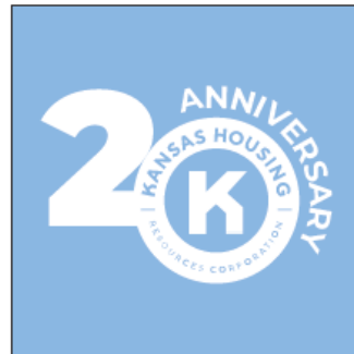
Variation White on Blue