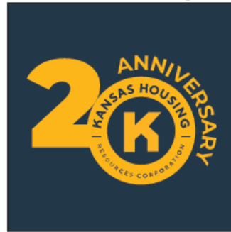
Variation Yellow on Indigo