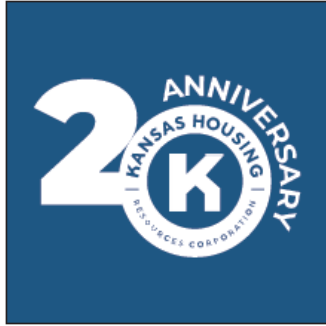
Variation White on Sapphire