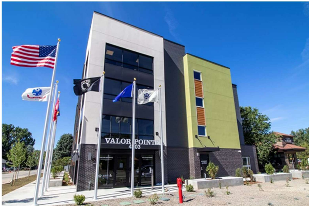
Valor Pointe – PSH for veterans in Boise