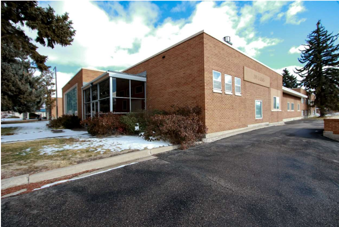
Aid for Friends – New shelter facility in Pocatello