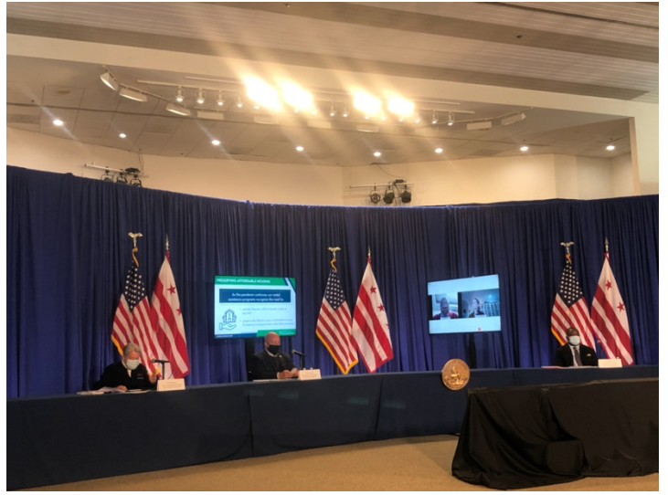
Photos from the tele-town hall