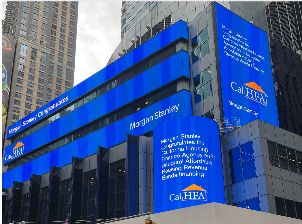
Photos from CalHFA being shown on the screen at Times Square