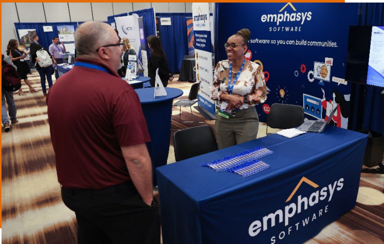
Price is per event.