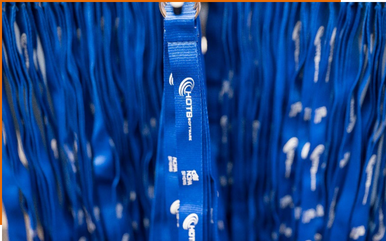
Price and availability are per event.