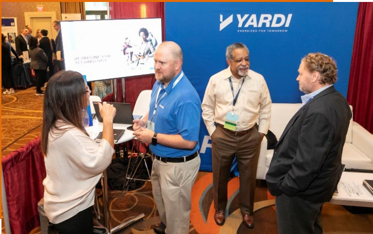
Price is per event.