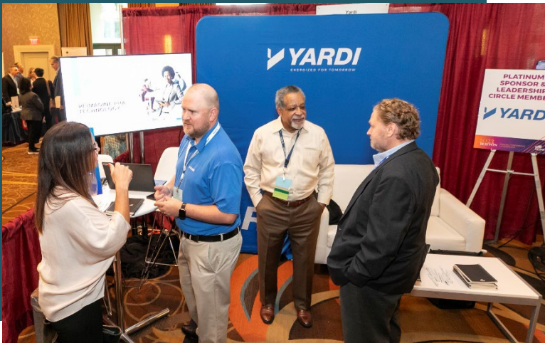
Price is per event.