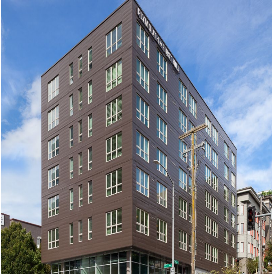
Plymouth on First Hill

Extraordinary things happen when you have great partners