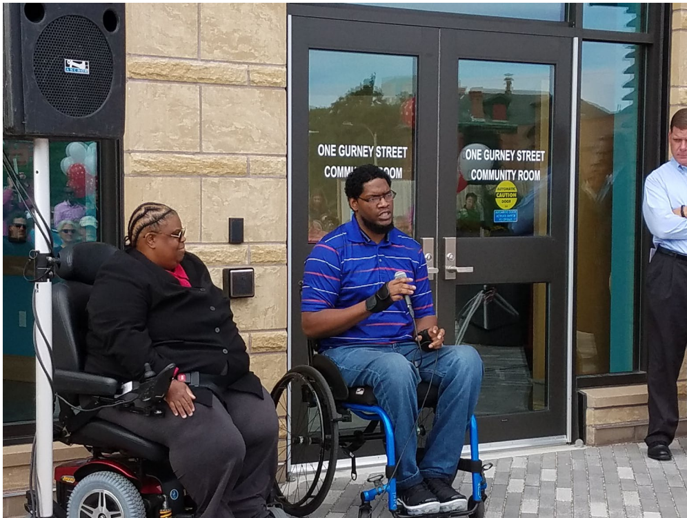
Parcel 25, Boston, MA Ribbon Cutting, 9.18