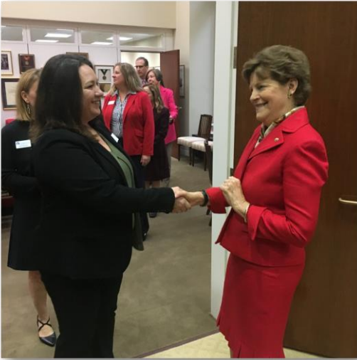
New Hampshire Housing Fellows meet with Senator Shaheen for a conversation with the Senator and her staff.