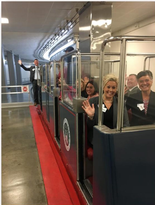
NHHFA Fellows get a private tour of the Capitol including a ride on the Capitol Subway system that connects the House and Senate office buildings to the Capitol building