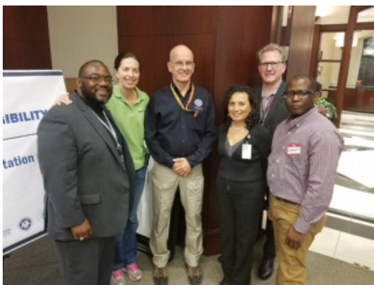
HOUSING FAIR PARTNERS INCLUDING HUD AND FEMA