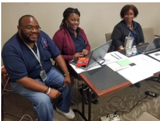
LHC, LHA AND PARTNERS CONDUCTING CONDUCTING INTAKE