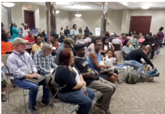
HOUSING FAIR ATTENDANCE