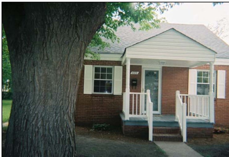
One of the homes revitalized through The Harvest Project.

affordable rental units for seniors or single family homes. VHDA has provided five planning grants – ranging between $3,000 and $5,000 – to assist churches with their housing projects.