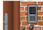
Remote Entry Devices

"There are many programs that provide services for homeowners. However, it is extremely difficult to meet the needs of the renters."