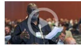
'Alt-Right' Condemned By Southern Baptist Convention

Williams says for homeless veterans to feel the same way, they need to look no further than these programs.