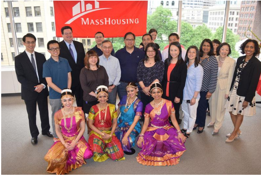
Celebration Planning Committee and Participants