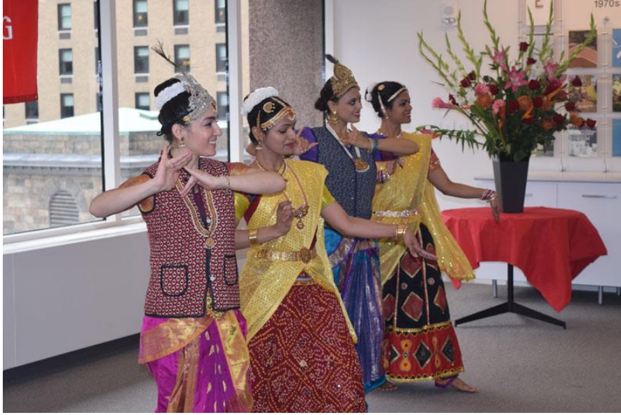
Performers from Triveni Dance School