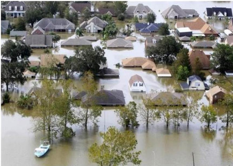
The combination of rain water and storm surge resulting from Hurricane Isaac caused substantial flooding in much of St. John the Baptist Parish.