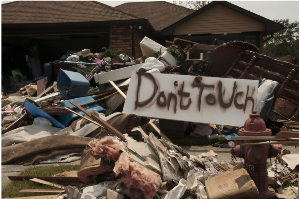
A home gutted in St. John the Baptist Parish following the flooding caused by Hurricane Isaac.