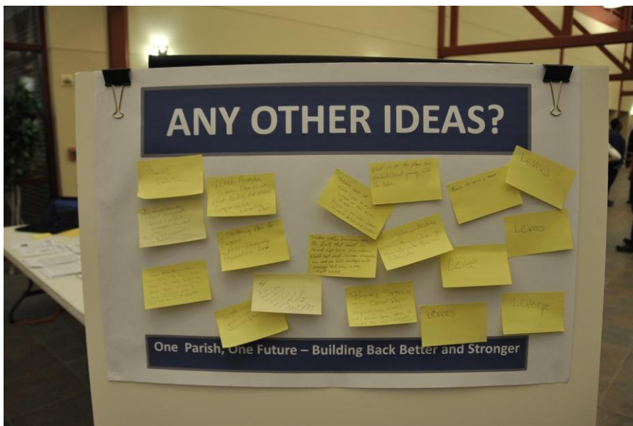
As part of the NDRF process, parish residents were asked to provide comments and feedback related to the Infrastructure needs of the Parish in the aftermath of Hurricane Isaac during several open house events held throughout the impacted area.