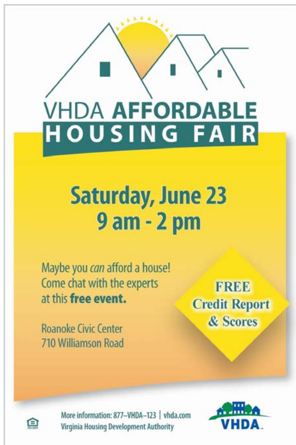
VHDA's Affordable Housing Fair Poster

Partnerships developed with the Governor allowed us to produce professional commercials advertising the Affordable Housing Fair at a lower cost. We also use the state's video production facility and produced all of the collateral for the fair in-house, thereby minimizing our costs and maximizing resources.