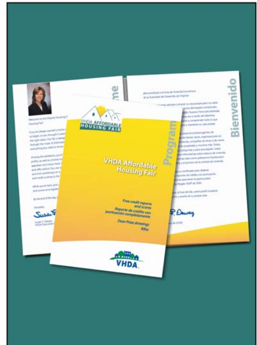
VHDA's Affordable Housing Fair Program Guide

The number of attendees—more than 1,000 for both years—as well as the dozens of positive comments received via attendee survey cards, prove success in the marketplace.